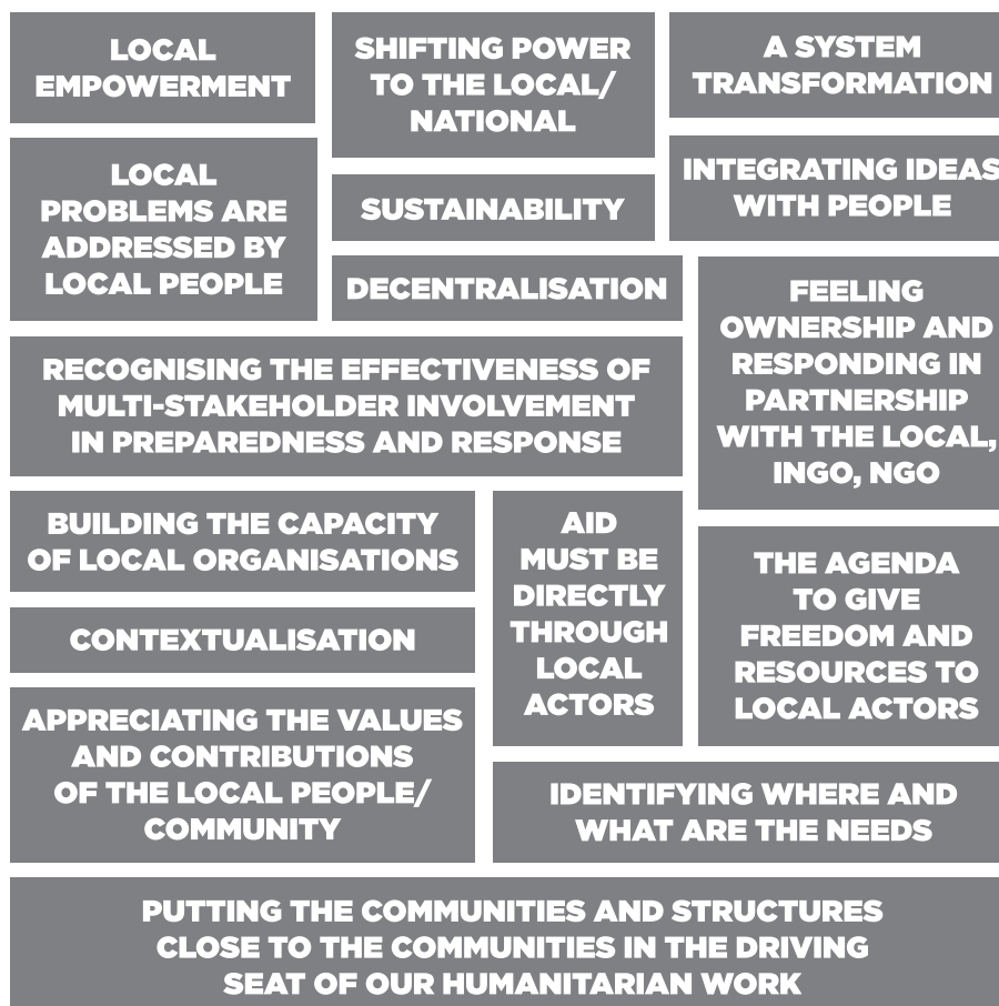
Figure 4: Responses to the question “what does localisation mean to you?” during a localisation event in Addis Ababa

humanitarian advisors, and evaluators. One deputy country director of a UN agency in a country with a major humanitarian crisis, for example, stated “ We are localised because the majority of our staff are nationals. ” Of the seven humanitarian advisors (5 internationals, 2 nationals) we spoke with in Bangladesh, three were knowledgeable about localisation discussion and commitments and committed to localisation, while four knew very little about it and did not consider it relevant. The text bundles below show the responses of over twenty participants taking part in an event on localisation in Addis Ababa.